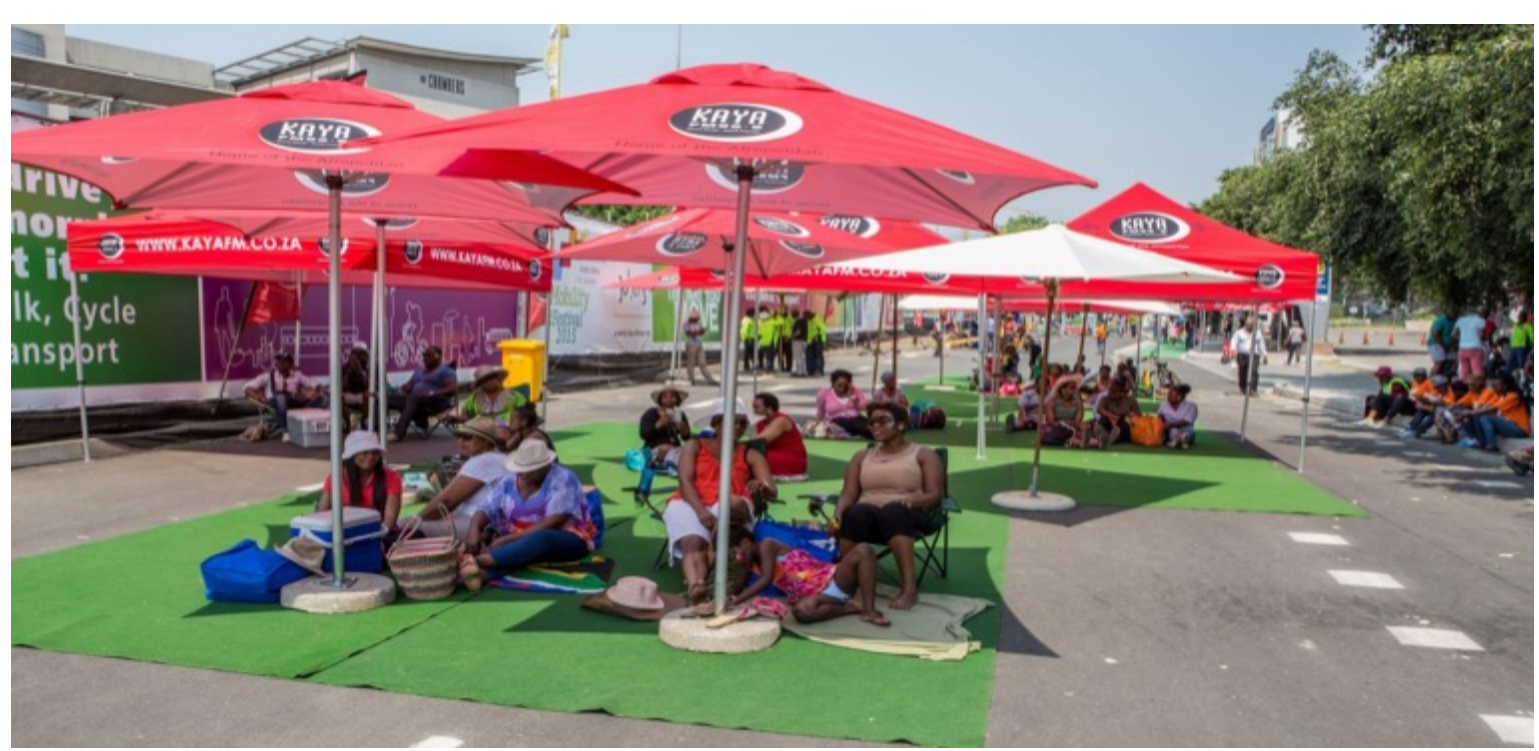
This road is usually filled with cars. Now people reclaim the area for a picnic.

The central business district of Sandton in Johannesburg, South Africa - often referred to as Africa's