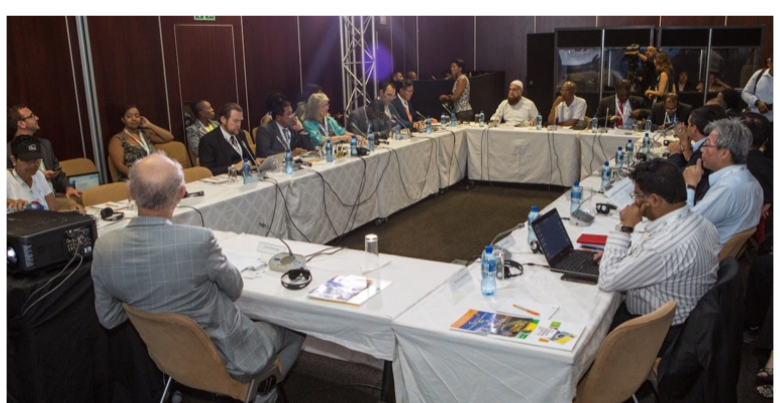
Local leaders, city officials, experts discuss the Declaration text with Johannesburg officials and ICLEI on 8 October 2015.

Establish national strategies, programmes and policies including financial support and incentive schemes that support cities in the provision and maintenance of ecomobile infrastructures and services.