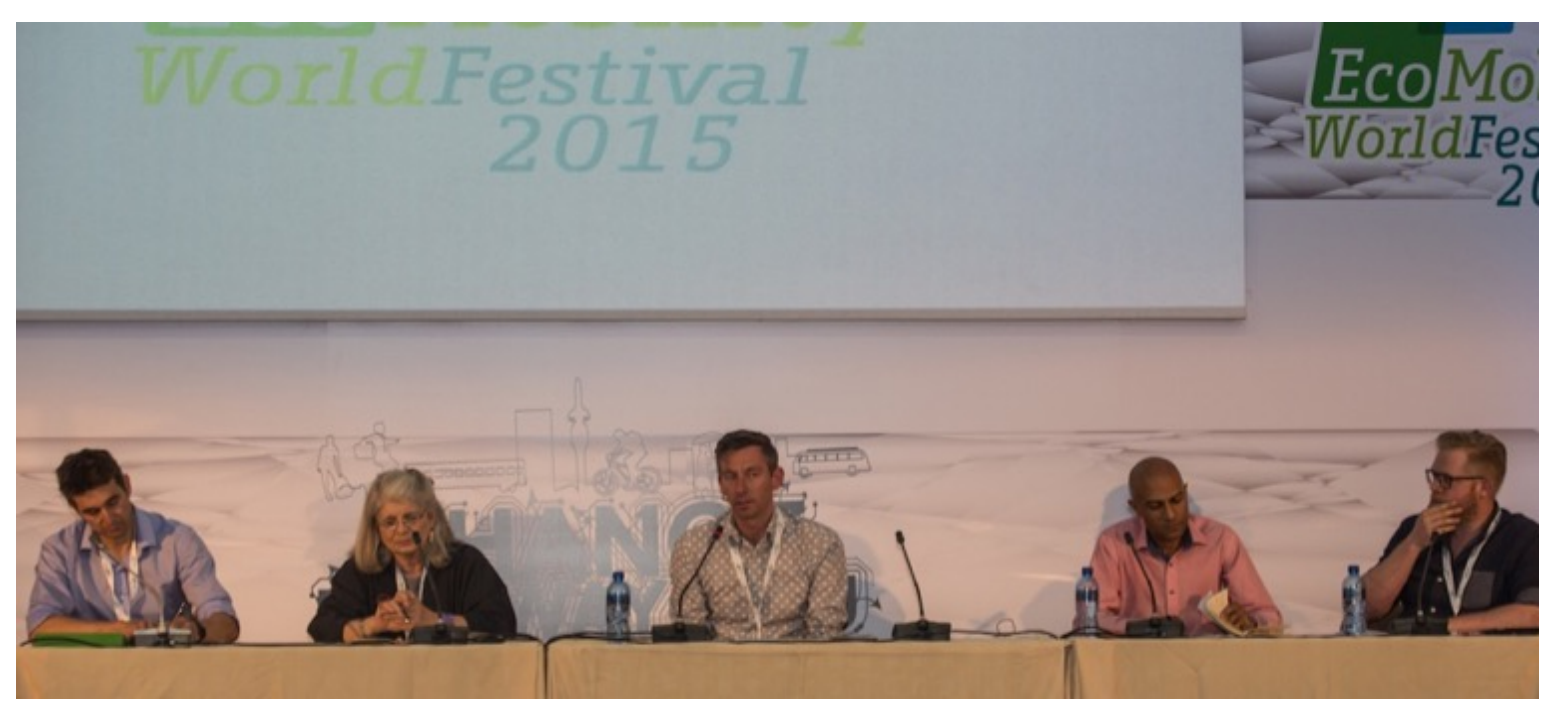
EcoMobility Dialogues was a meeting of the minds locally, nationally, regionally and globally to share experiences and implement actions