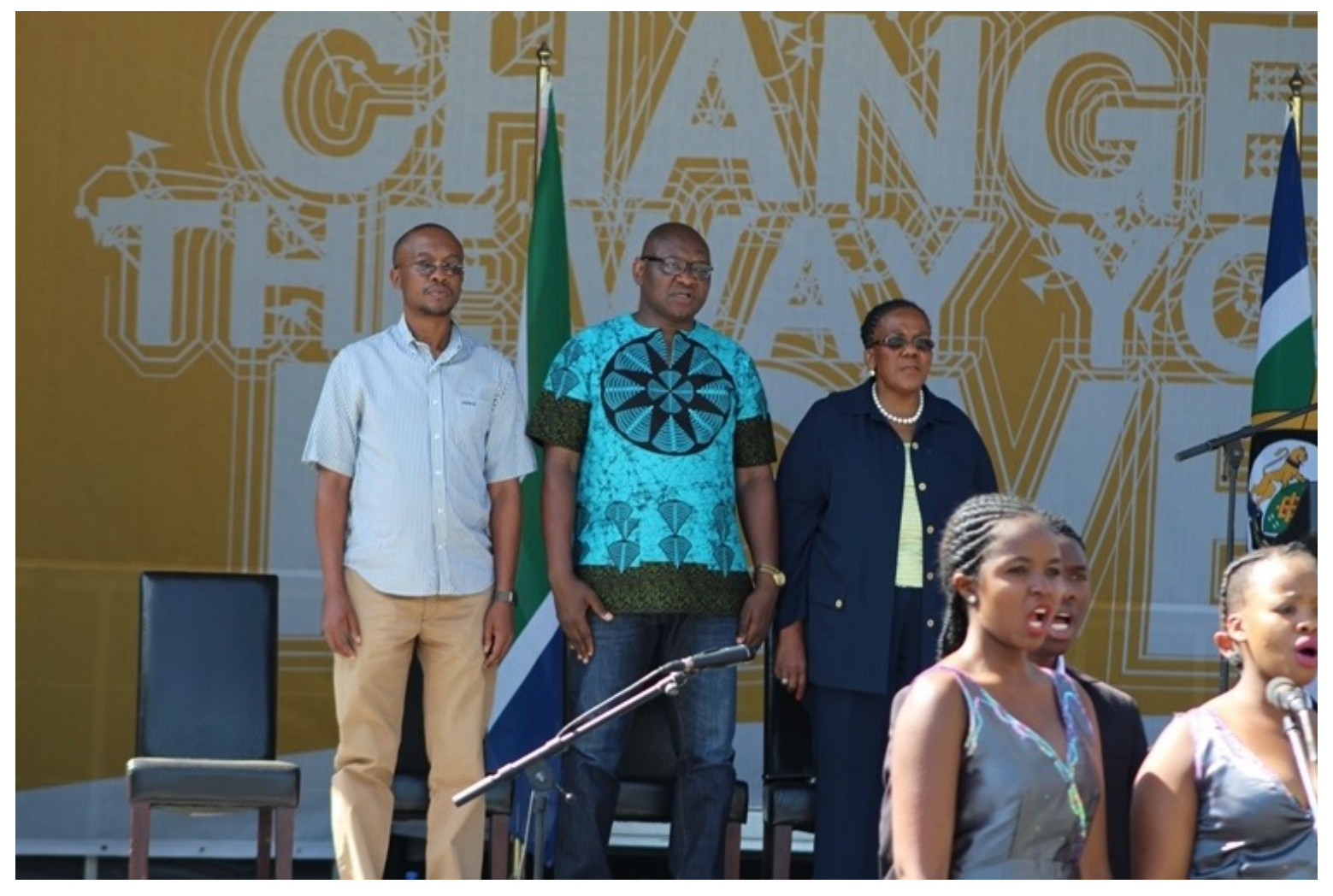
Key decision makers from all spheres of governments meet to show commitment to ecomobility

The Festival opened with an action commitment by all spheres of government. Strong opening speeches confirmed commitments to transforming the regional transport system. Leaders committed to the EcoMobility World Festival included the Premier of Gauteng Province, Mr David Makhura; Member of the Executive Council at the provincial level for Roads and Transport, Mr Ismail Vadi, as well as the South African Minister for Transport, Ms Dipuo Peters. They reconfirmed their plans to expand and improve the public transport in South African cities.