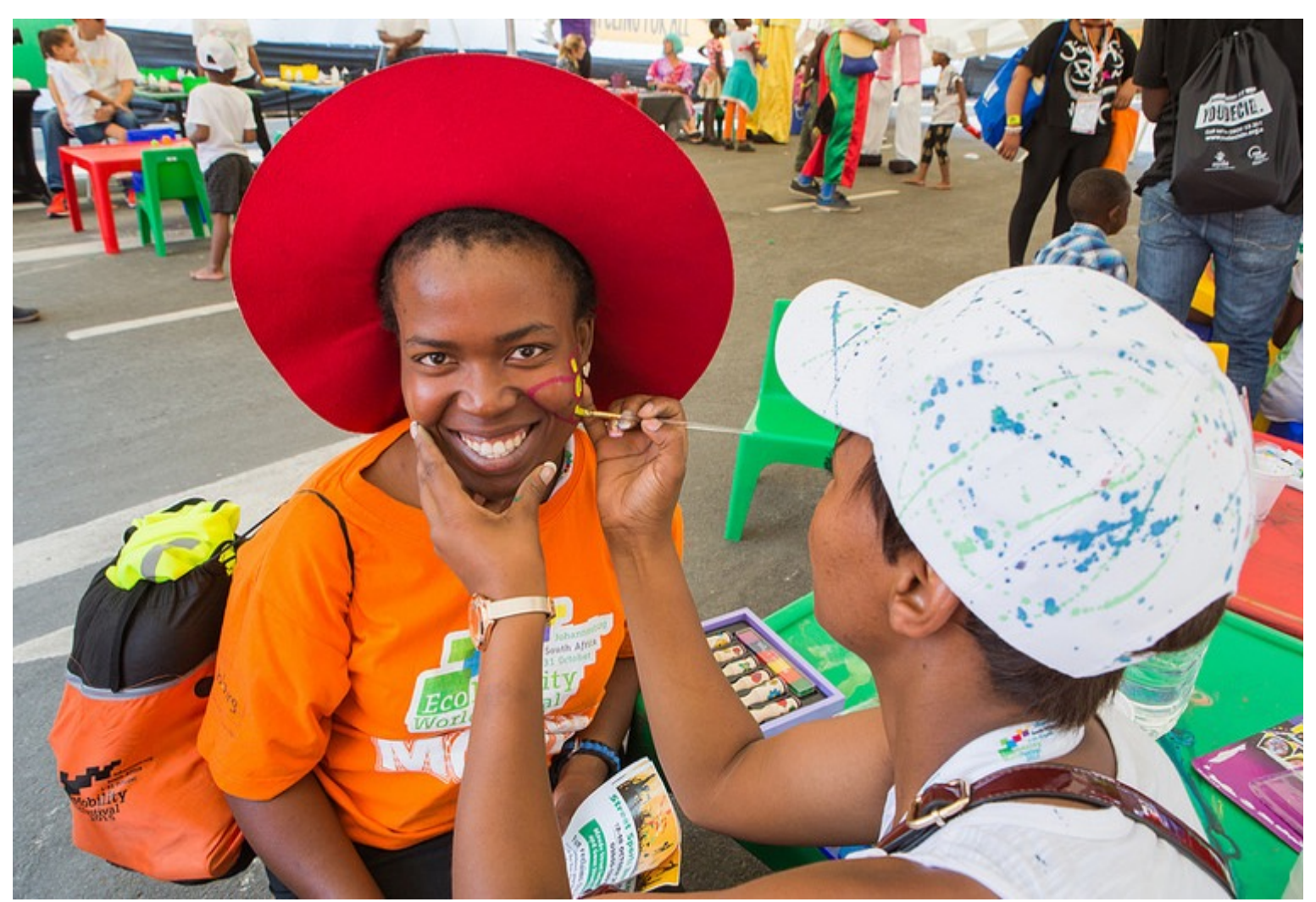
Streets are alive with people reclaiming the road space